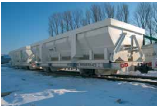
Gravel transport silo, 11,6 m 3 net content