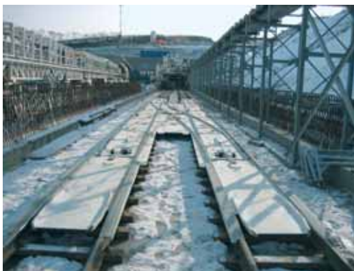
Mobile cross over switch with lowest possible construction height