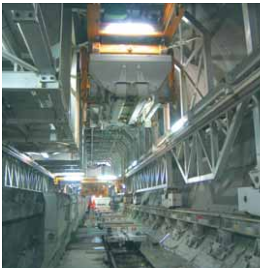
Simultaneous transloading of sand and bonding agents with invert concrete transloading