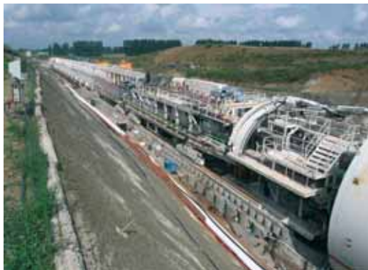
Back-up installation in front of the Section Wienerwald Tunnel