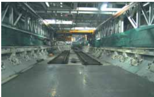
Just installed concrete floor ready for rail construction

The back-up 2 consists of the transloading train station with double rail for unloading the various trains and the floor lining construction site with a slide finisher. In the upper area, the transport route for the heading supply has been spatially separated. Finally, the interim storage and the installation area for the lining segments, the four components for the annular gap back filling and the track installation with special consoles for the back-up, are placed in back-up 1. The infrastructure of the shield machine is placed on the middle deck.