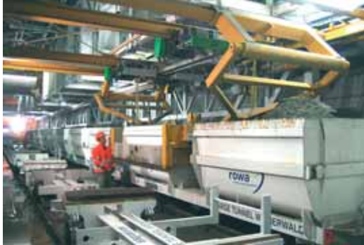
Unloading of invert concrete transport container (4,5 m 3 ) with special crane