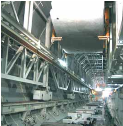
Lining segment transloading over open shafts in the train station area