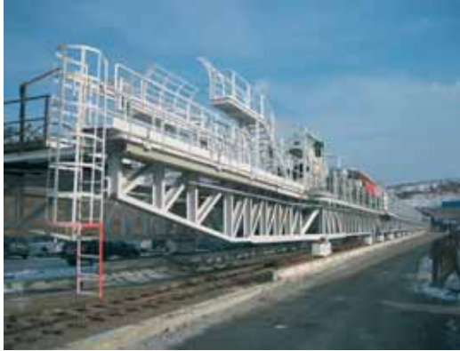
Back-up installations ready for the heading

The concept for these tunnels provides for construction of two single-track tubes with segment lining. The lining segment length amounts to a considerable 2,25 meters. Furthermore, invert concrete will be built into the heading area. The interior timbering and walling takes place in various phases behind the back-up and mainly consists of the in situ concrete interior sleeve, the cable pan with the arrangements of the wiring and the rail bed floor. Cross passages are built between the heading and the above mentioned final timbering and walling. The two tunnel heading machines are in operation since autumn 2005 and early 2006. The tunnel boring machines from Herrenknecht AG are in operation together with the two 240 m long back-up installations from Rowa Tunnelling Logistics AG in Wangen, SZ. This is the first time that tunnel heading machines of such a diameter range are being used in Austria.