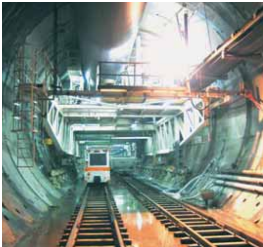
The back-up system is fit for double-track passage over the entire length of the train station. Thereby both, the heading supply as well as the invert lining supply, are equally ensured.

The concept for these tunnels provides for construction of two single-track tubes with segment lining. The lining segment length amounts to a considerable 2,25 meters. Furthermore, invert concrete will be built into the heading area. The interior timbering and walling takes place in various phases behind the back-up and mainly consists of the in situ concrete interior sleeve, the cable pan with the arrangements of the wiring and the rail bed floor. Cross passages are built between the heading and the above mentioned final timbering and walling. The two tunnel heading machines are in operation since autumn 2005 and early 2006. The tunnel boring machines from Herrenknecht AG are in operation together with the two 240 m long back-up installations from Rowa Tunnelling Logistics AG in Wangen, SZ. This is the first time that tunnel heading machines of such a diameter range are being used in Austria.