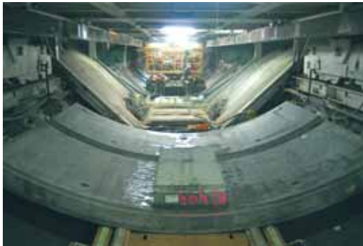
Transloading place for special consoles (for back-ups) and lining segments behind the lining segment magazine