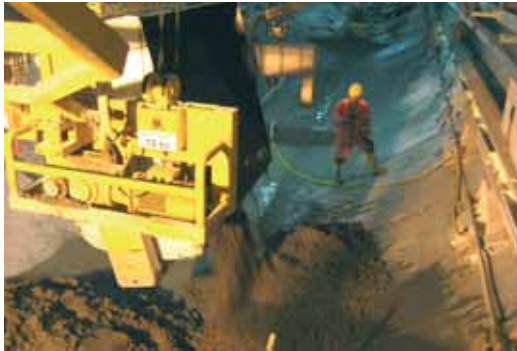
A high performance transloading crane with basket discharge installation (360°) supplies the floor lining construction site with fresh concrete